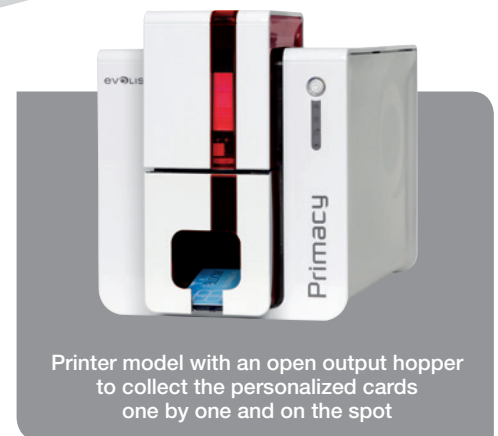
Printer model with an open output hopper to collect the personalized cards one by one and on the spot