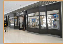
Standalone Access Control: Shop