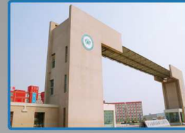
Networked Security: School