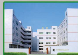
Time Attendance: Factory