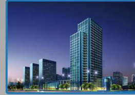
Networked Security: Building