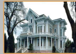
Standalone Access Control: House